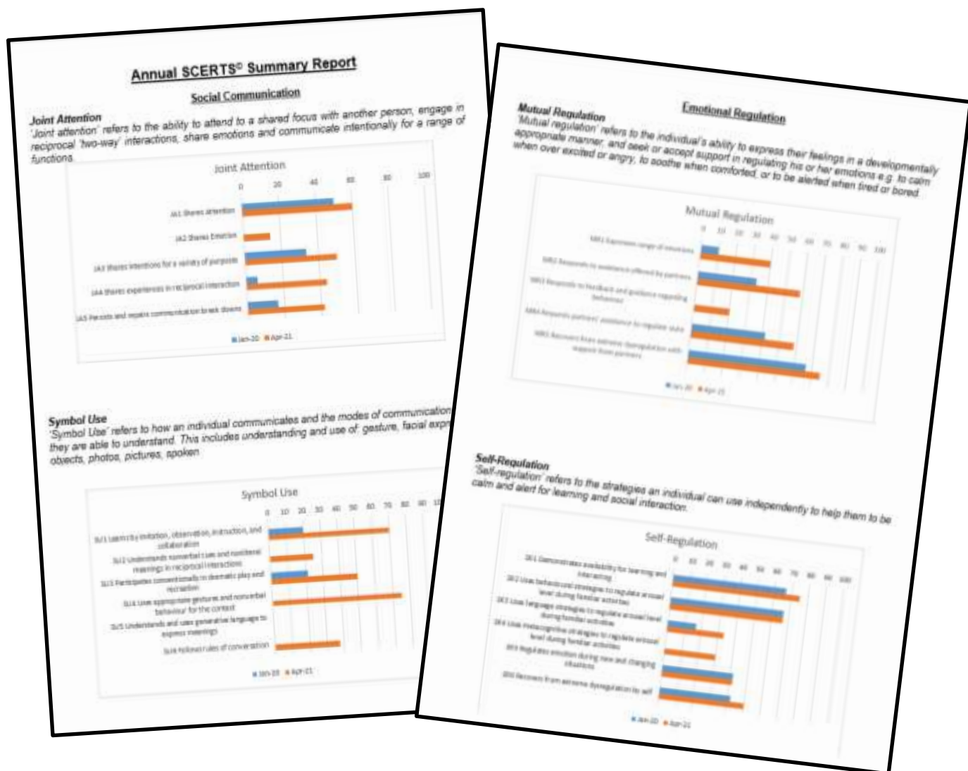
Figure 2. Exemplar of a SCERTS ® Annual Review Summary Report

Wide variation in the needs of our pupils means there is no one standardised measure that is appropriate for all pupils, or even for the same pupil at different points in their development. This difficulty is being addressed through RLS's use of the published, evidence based, SCERTS ® framework, which provides an observational assessment process that is relevant to all pupils and enables progress to be tracked from baseline to the time a pupil leaves Radlett Lodge (see Figure 2).